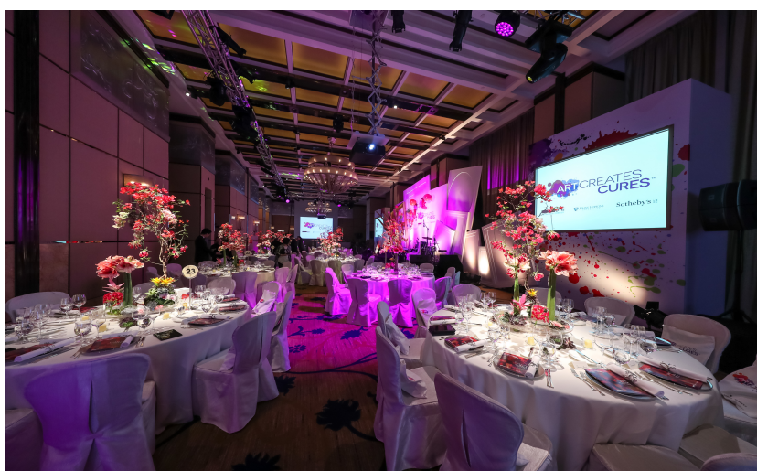
Art Creates Cures Gala at the Four Seasons, Hong Kong on March 28, 2018

At Art Creates Cures, we understand what art can do. Art can be a driving force, a hope, and, one day, help lead to a possible cure. Thank you for letting art be a miracle and strength not only for the healthy, but also for those who are in pain. This is only the first step of ACC's efforts to make a difference. Following this initial success, we will continue to bring together the art and scientific worlds to battle pancreatic cancer through an annual gala as well as other means and continue to raise money for this important cause. The continued support of our friends and partners will have impact!